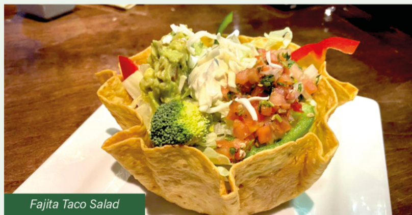
Fajita Taco Salad