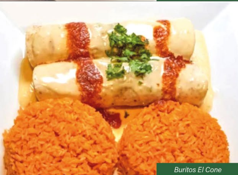
Buritos El Cone