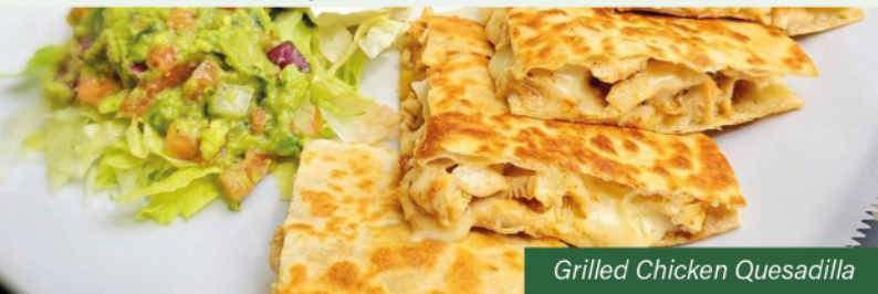
Grilled Chicken Quesadilla

Shrimp, chopped lettuce, diced tomatoes, broccoli, bell peppers, onions, avocado, and croutons with shredded cheese on top. 13.5