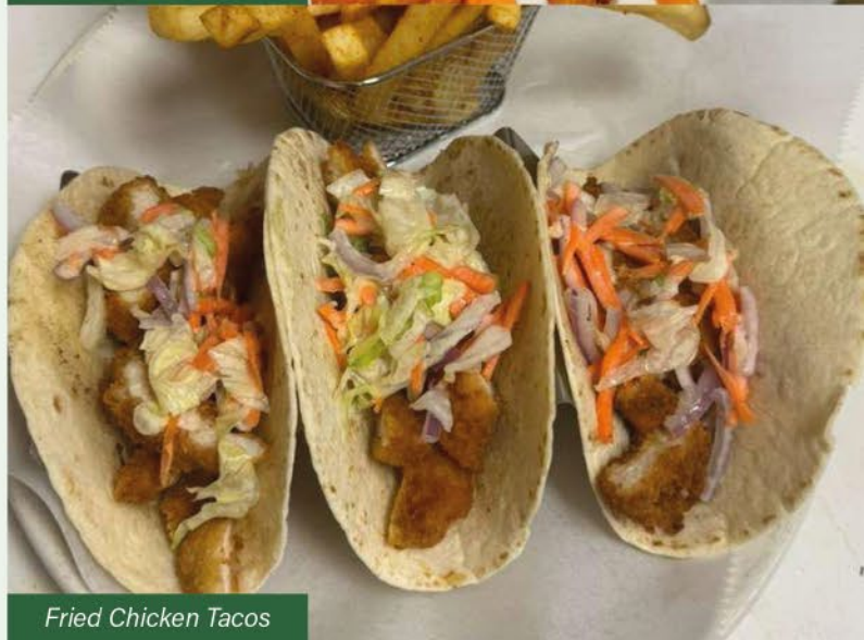
Fried Chicken Tacos