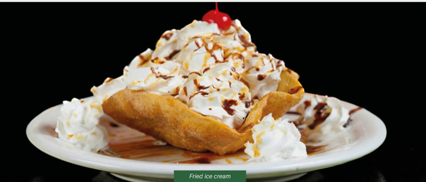
Fried ice cream