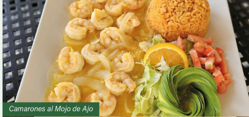
Camarones al Mojo de Ajo