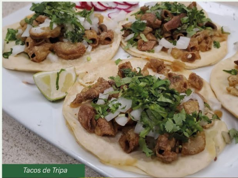
Tacos de Tripa