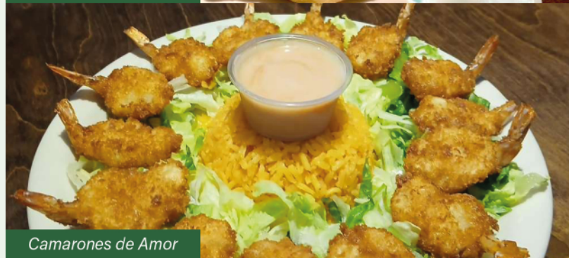
Camarones de Amor

*These items can be cooked to order. Consuming raw or undercooked meats, poultry, seafood, shellfish, or eggs may increase your risk of foodborne illness, especially if you have certain medical conditions.