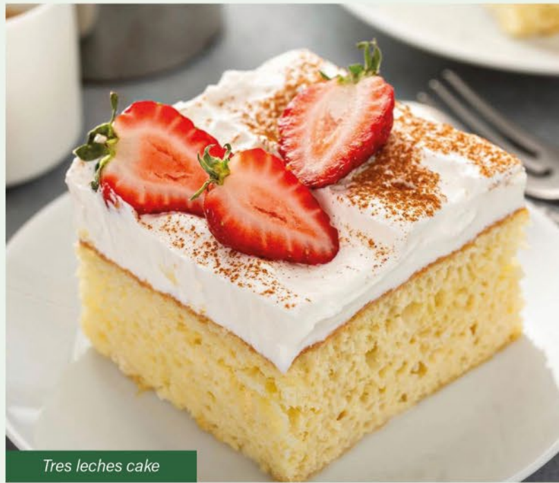
Tres leches cake